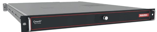
OneU ED extinguishing systems