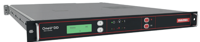
OneU DD aspirating smoke detector systems