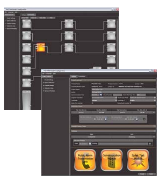
Even complex applications are easy to configure

For special applications requiring increased emergency power, the panels can be optionally expanded with an added power pack, which is flange mounted in a separate case on the underside. This increases max. battery capacity to approx. 40 Ah.