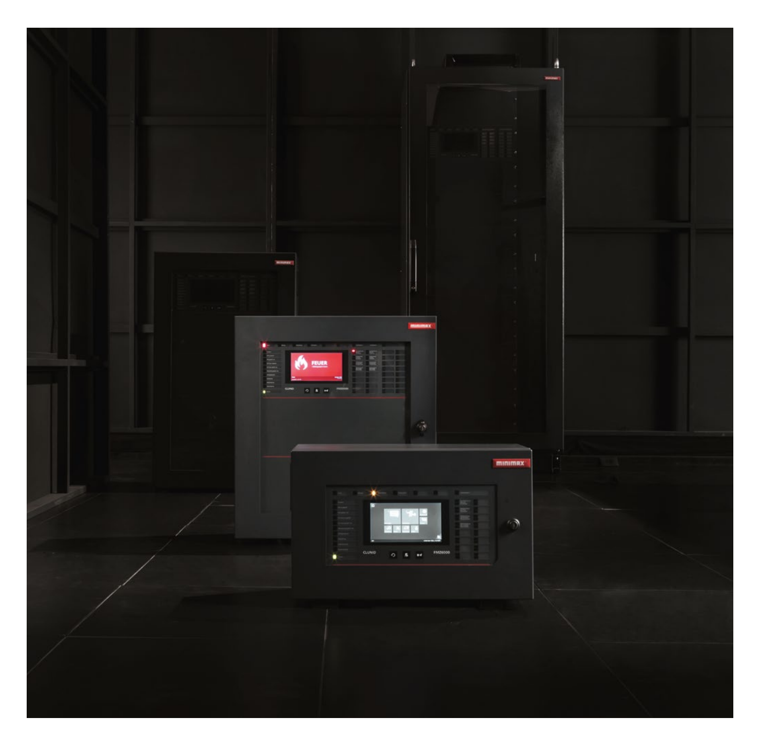
Clunid FMZ6000 fire detection and suppression control panel