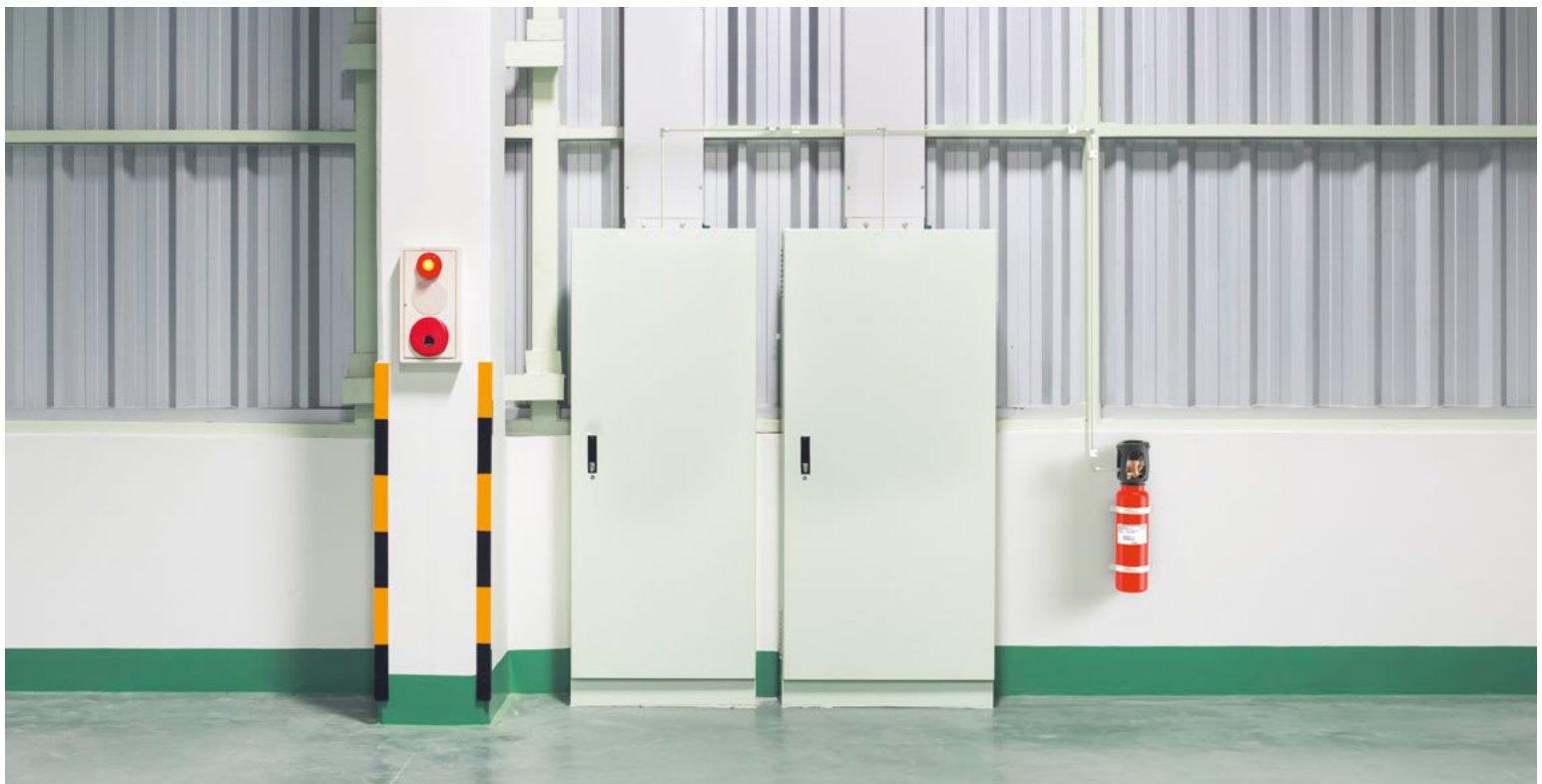
CPS 1230 Cabinet Protection Systems

Minimax is a pioneer in the development of spark suppression systems and offers spark suppression systems with VdS approval and also with FM system approval. Its protection strategy has been successfully tried and tested in thousands of applications worldwide.