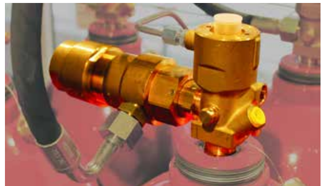
Oxeo ConstantFlow Technology cylinder valve with high-performance pressure regulator

When using Oxeo ConstantFlow technology the connected conduits and selector valves need only to be designed for the low pressure level of 60 bar maximum, which may result in significantly profitable solutions being implemented in many cases.