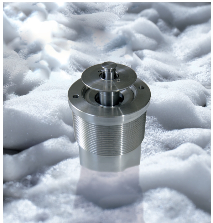
Open position pop-up foam extinguishing nozzle