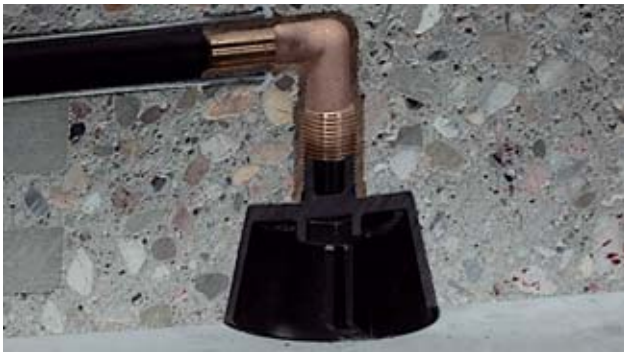
Undercover sprinkler pipe system embedded in concrete – with concrete mould still fitted

Designed specifically to be embedded in concrete, the undercover pipe system is our response to the growing trend of integrating modern installations into ceilings in a harmonious and inconspicuous way. Both pipes and sprinklers can now be installed in a way that makes them almost invisible. The Undercover pipe system was designed for use with Minimax Undercover sprinklers, but can also be used with conventional sprinklers.