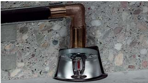
Undercover sprinkler pipe system embedded in concrete – with Undercover sprinkler installed